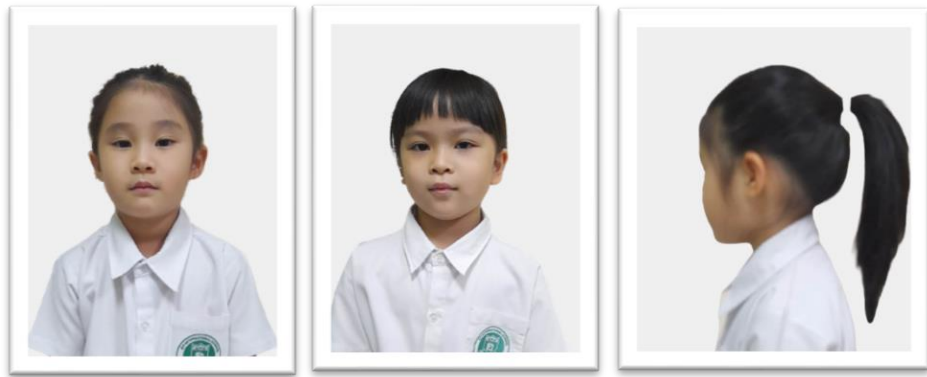
Boy's front and side view